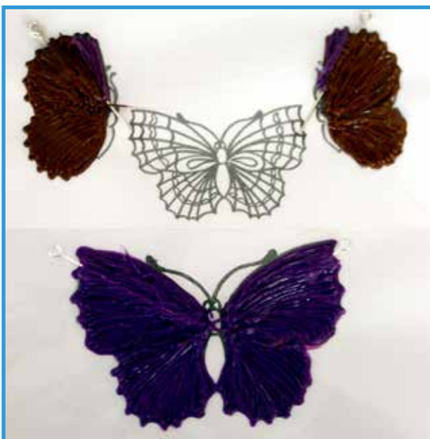
2: first layer completed!

1: first layer: fill in the main colours (really purple for the big one and brownie brown for the small butterflies) and insert the eyepin as shown