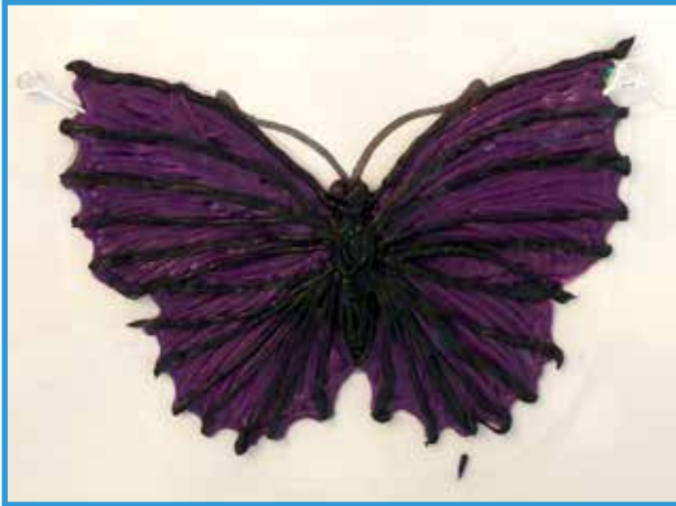
3: second layer: black details