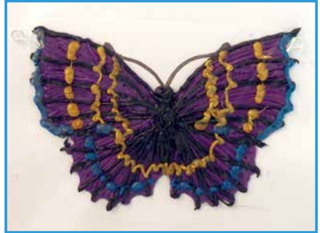
4: third layer: metallic details