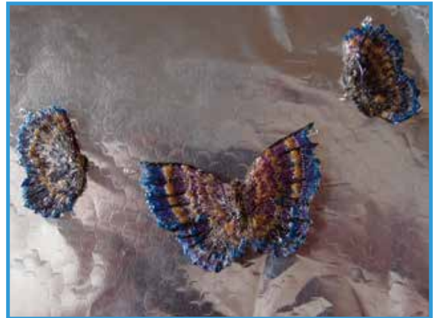
9: put all your pieces on aluminium foil