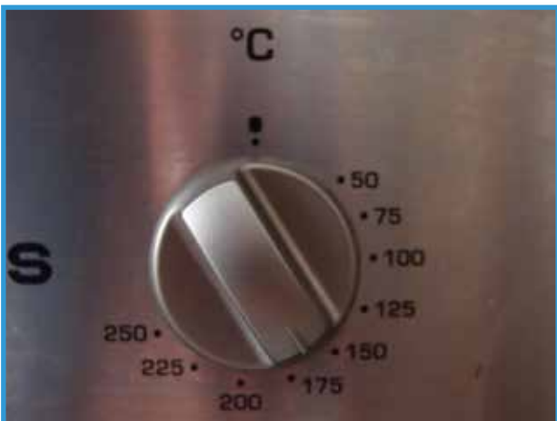
10: now it's baking time: 12 minutes at 160°C at the middle slide of your oven should do it...