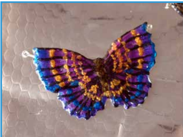
12: get your pieces out of the oven carefully and let them cool a couple of minutes before peeling them off; then add the antlers