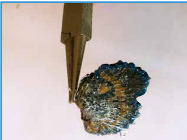
7: curl in the straight parts of the eyepins used on the small butterflies