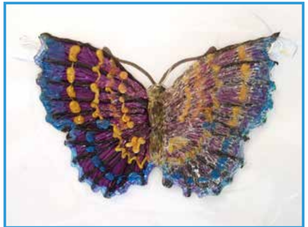
6: fifth and last layer: clearly clear on top of everything