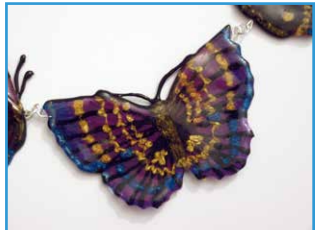
13: time to assemble your necklace: connect the butterflies using the split rings