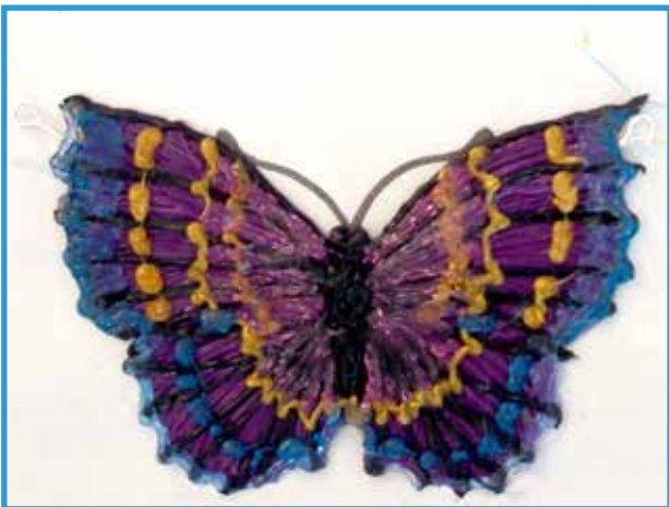
5: fourth layer: translucent parts (many layers more possible)