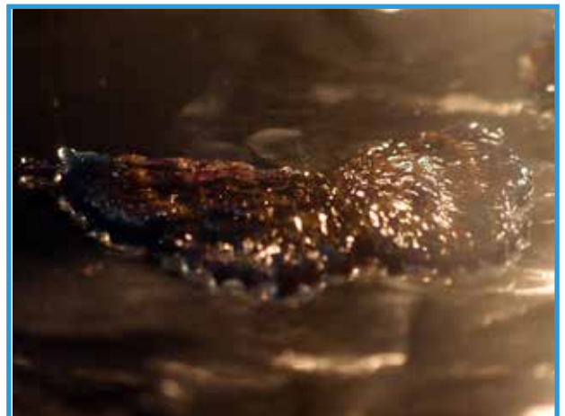
11: watch the PLA melt and become glossy!