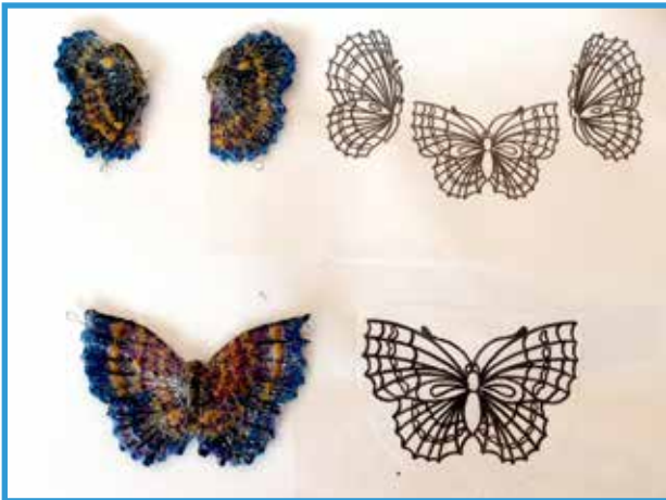
8: repeat all the steps for each butterfly