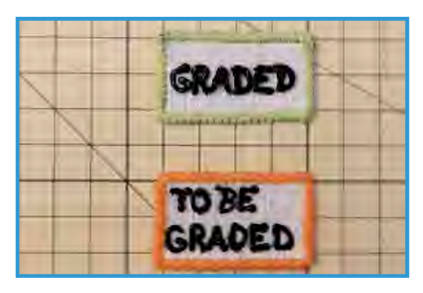
Add the writing.

Print the stencil. Make sure to use either your Doodle pad or cover the paper sheet with tape to be able to peel off your doodle afterwards (if you are using PLA). Start with doodling the "board", then add the frame.