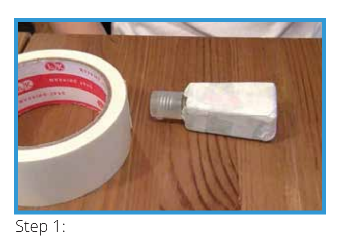
Get a hand sanitizer and cover it up with masking tape.