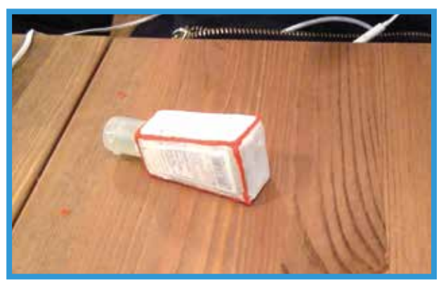
Step 2: Doodle the edges of the hand sanitizer.