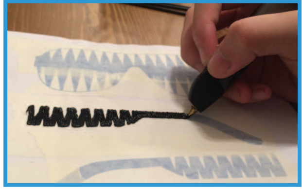
Step 6: Fill in the stencil for the temples of the glasses.