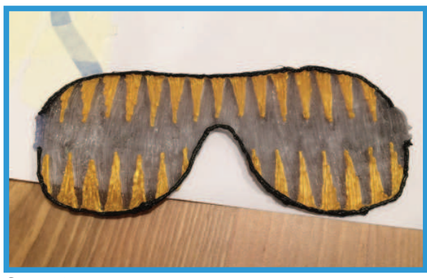
Step 4: Create a rim.