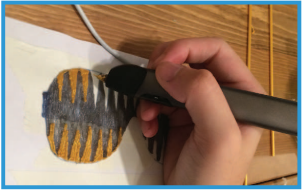
Step 3: Then add details on the lens.

Print the stencils and cover it up with clear or masking tape. (You can also make your own design!)