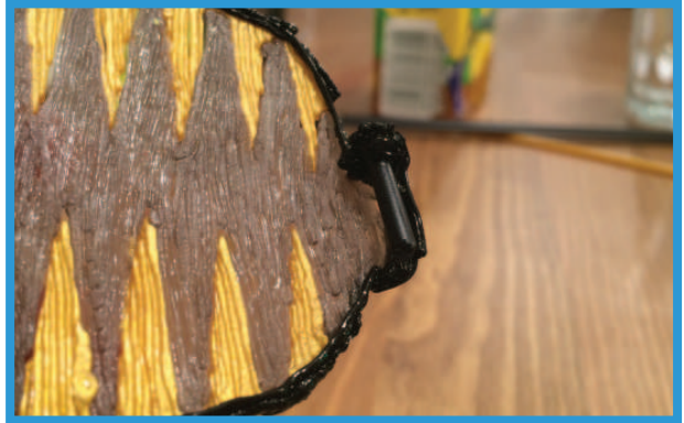
Step 8: Stick in a small strand as a screw.

To create a hinge, use the unblocking tool, stick masking tape over it and doodle over it. Remember to roll it while it's hot so that it gives a more firm hinge.