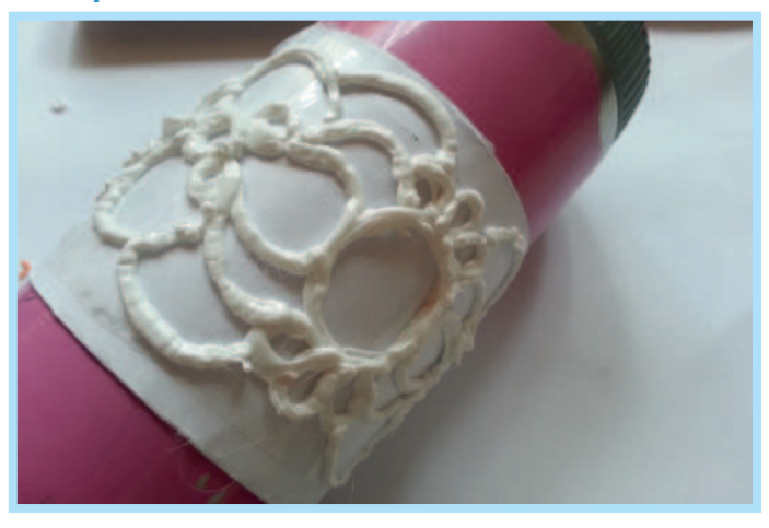
Start to outline your lovely bracelet!