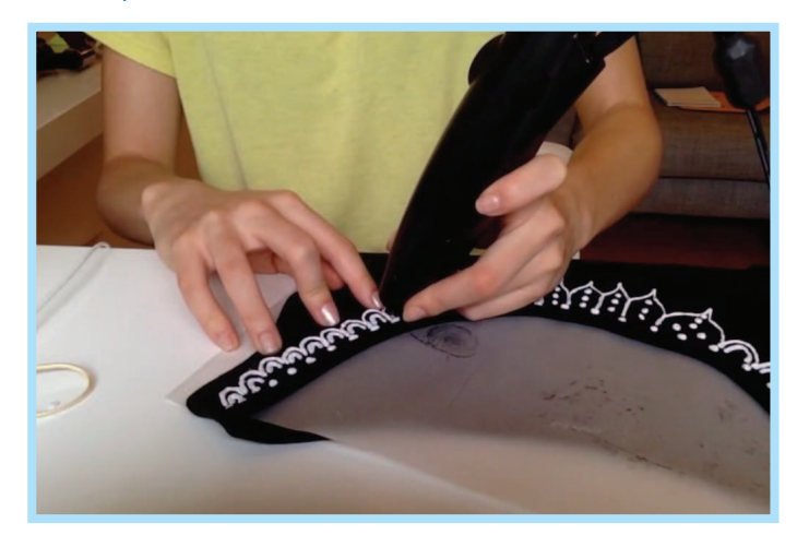
Make sure you use PLA plastic for this doodle.