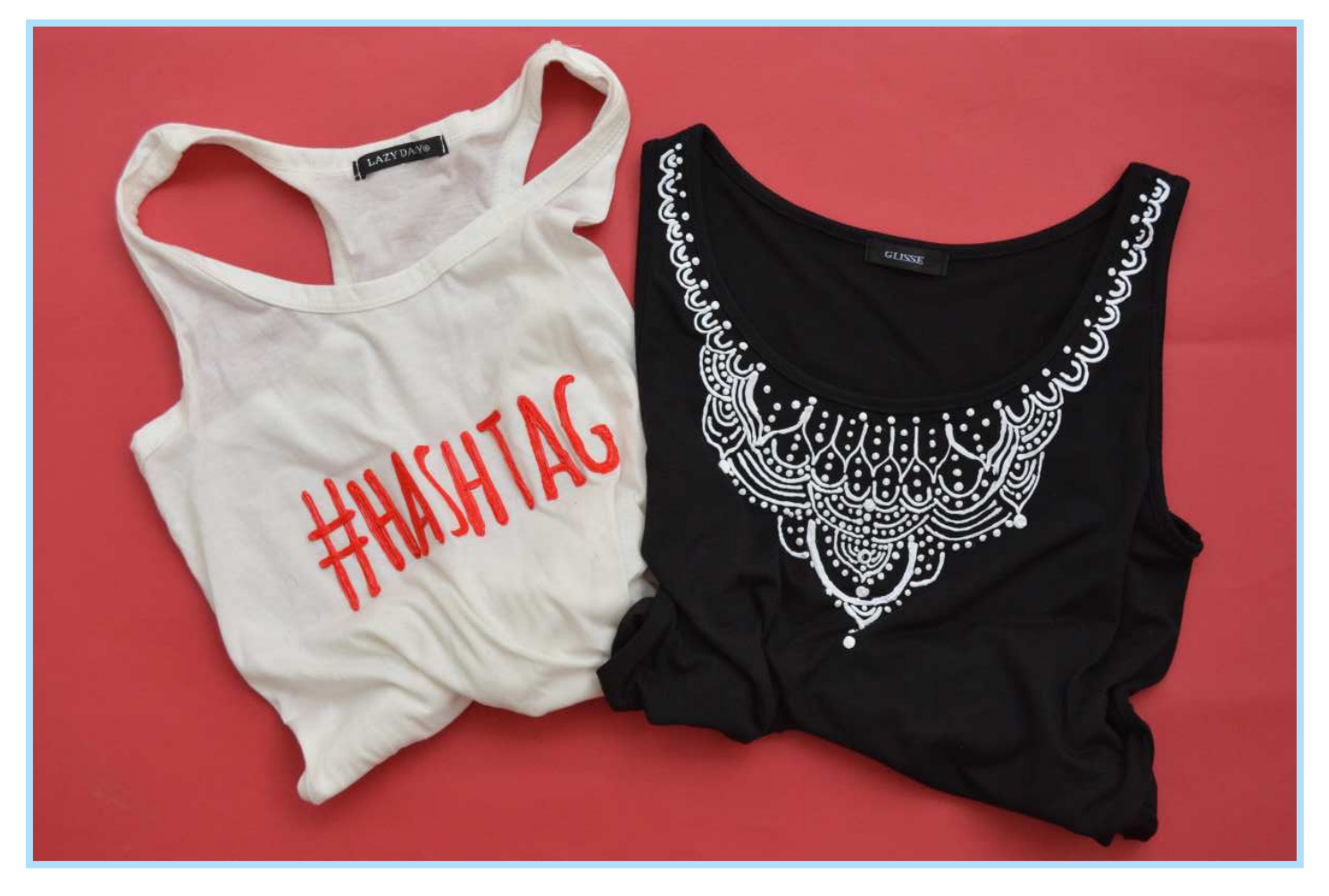
Have fun designing your own clothing!